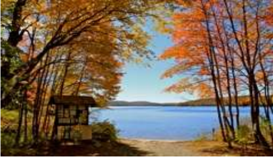
Goose Pond.